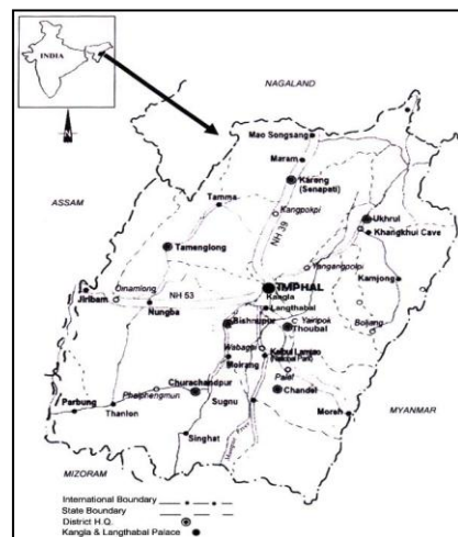
MANIPUR KANGLA PALACE

From the second half of the 19 th century, the architectural trends of temple and other buildings appear to have much changed in comparison to the predecessors. This period marked the best synthesis of the Muslim ideas and Hindu method in the construction. From this period, experimented with numerous geometric forms and adopted different style in the construction. The Indo-Islamic style was popular in this period both secular and religious buildings. The decoration of sculpture as an element of external decoration on the temple and palace was not practice in Manipur. Only leaf and floral motifs and geometrical designed used as decoration. The dome roof including oblong, octagonal dome, arch entrances and external decorations (only leaf and floral motifs and geometrical designed) were the best example of Islamic influences of the 19 th and 20 th century temples and other secular buildings of the Kangla palace.